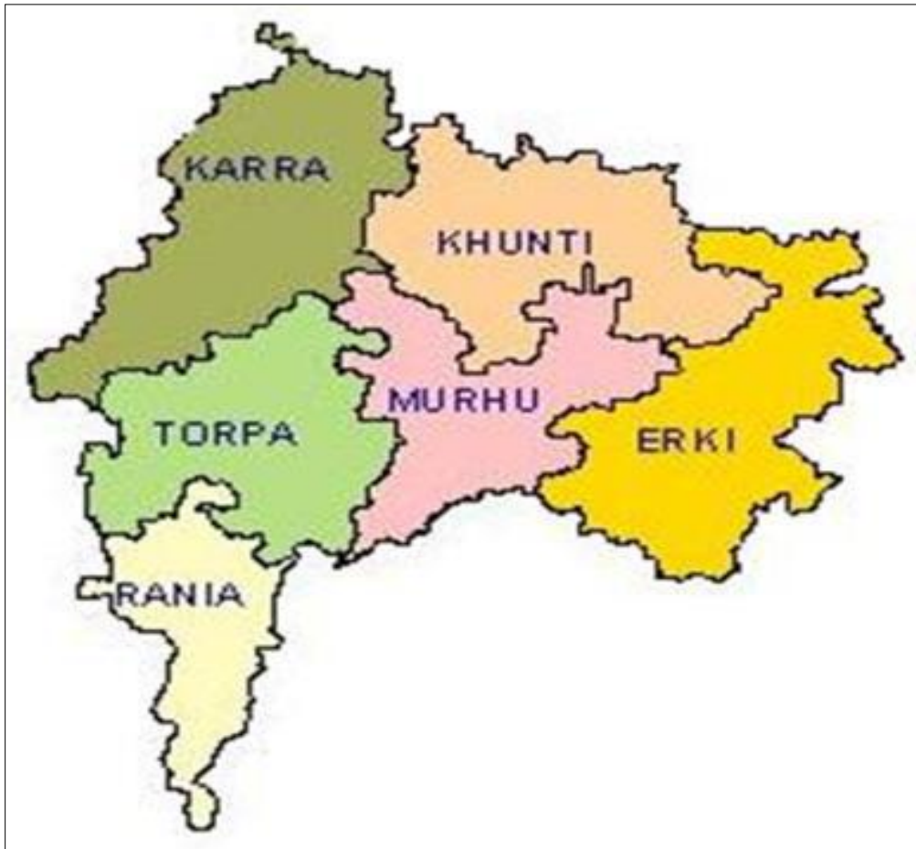
Figure 2: Map of Khunti District

Money lending is very common. Families have taken loans either from banks or from informal moneylenders. Families have mortgaged land for a small amount of loan. A major cause of money lending is migration with families taking loan to go to cities in search of work.