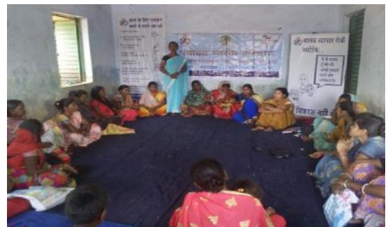
Figure 4: Panchayat level workshop