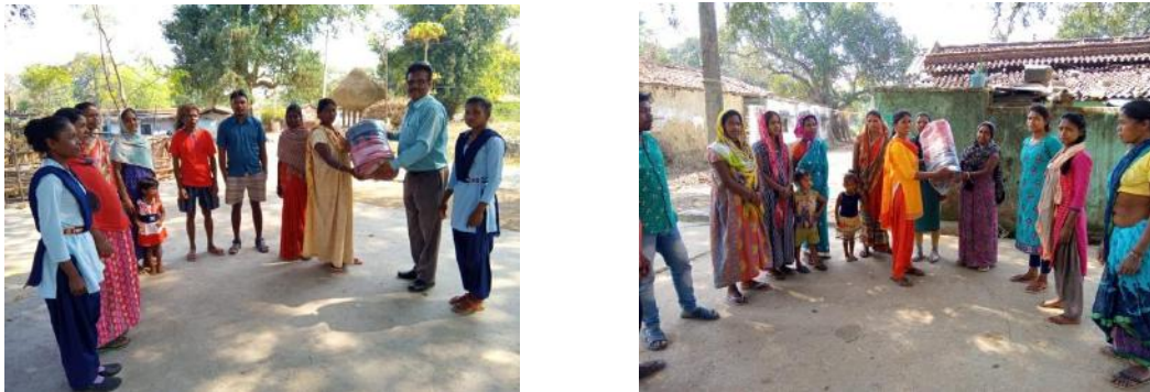
Figure 6: Dari distribution