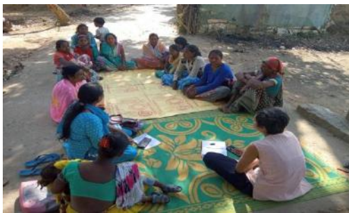
Figure 3: Village level meeting