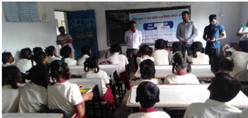
Figure 5: School Awareness program