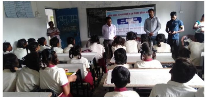
Figure 9: School Awareness program