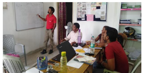
Figure 5: Staff training