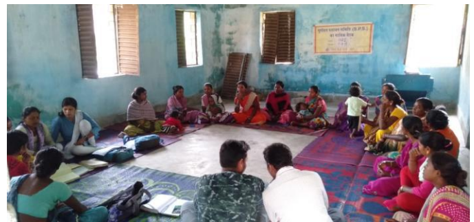
Figure 4: SPS meeting