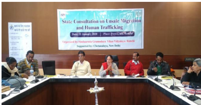
Figure 3: State consultation on safe migration and trafficking