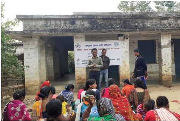
Figure 6: SPS capacity building program