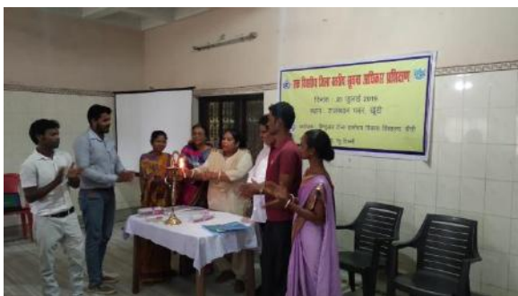
Figure 7: SPS RTI training