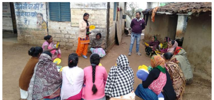
Figure 10: Meeting with women on Govt. schemes