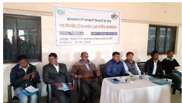
Figure 8: Interface program with Government department